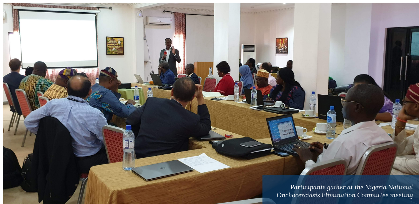
Participants gather at the Nigeria National Onchocerciasis Elimination Committee meeting