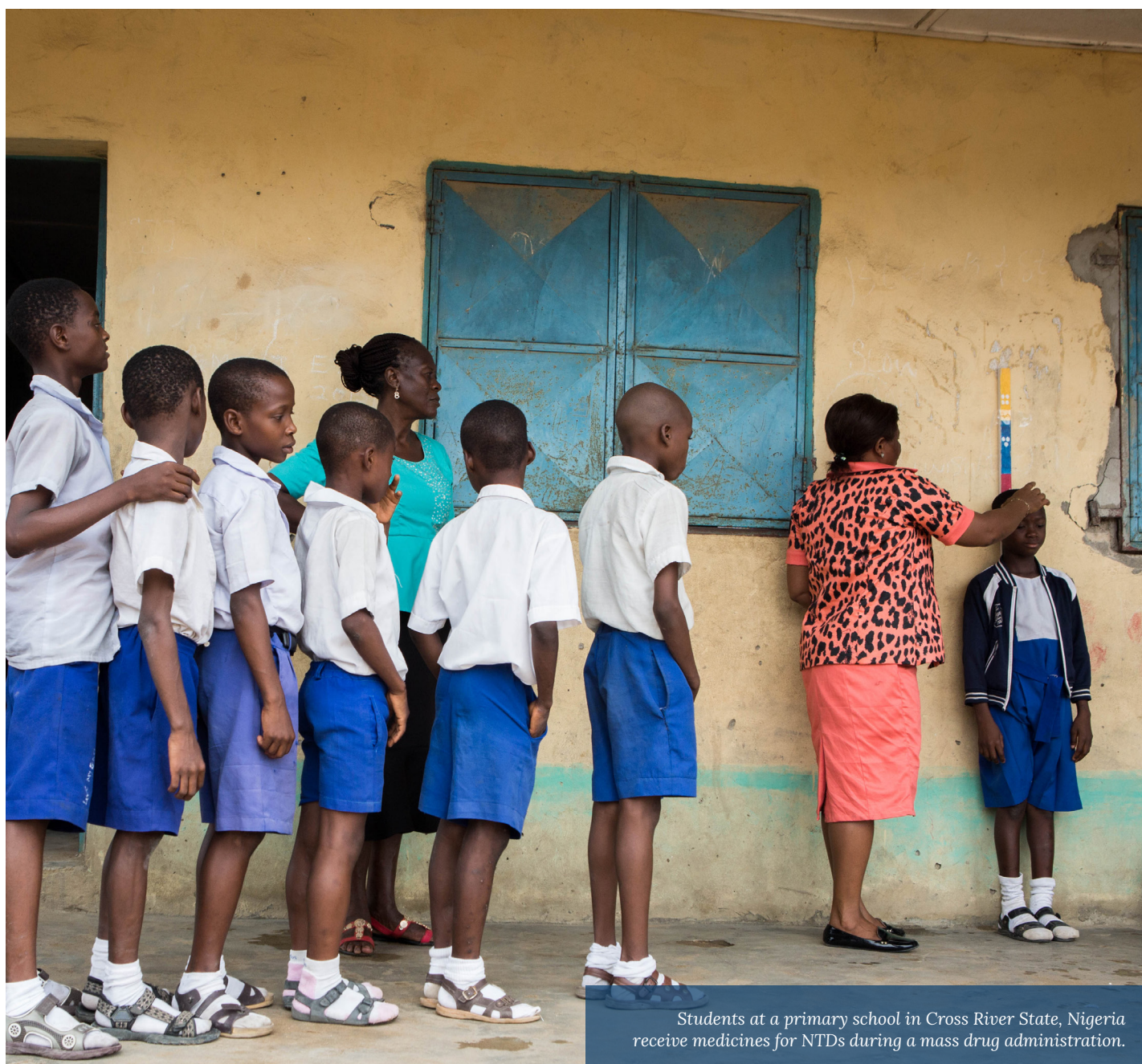
Students at a primary school in Cross River State, Nigeria receive medicines for NTDS during a mass drug administration.