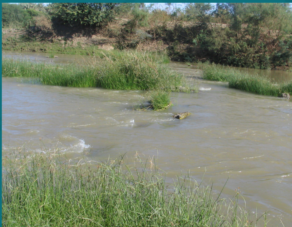
A breeding site where 'slash and clear' could be used to reduce black flies.

'Slash and clear' involves clearing trailing vegetation from rivers in order to reduce black fly breeding sites. v