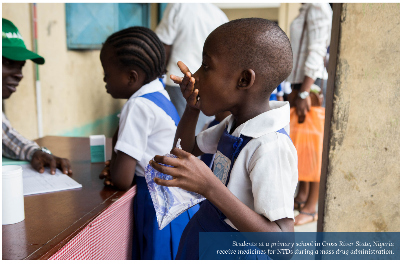
Students at a primary school in Cross River State, Nigeria receive medicines for NTDS during a mass drug administration.

A key recommendation from the WHO 2016 guidelines is to establish a national independent onchocerciasis oversight committee comprising national and international members to advise the country program on the OV elimination process. The committee can be highly responsive to the contextual needs of a country program and should convene at least annually to assess OV elimination progress and recommend enhanced interventions or stop MDA activities. Data is critical to this process and it is important to note that the committee needs results of routine field studies (especially mapping, O-150 PCR and OV16 ELISA surveys). OV elimination committees can also be established at a sub-national, focus-level, or cross-border level to encourage community engagement and provide insights on the elimination process. The examples above illustrate how these committees can provide strategic support and empower national programs to actively respond to their unique challenges. These committees play an essential role in OV elimination. A more comprehensive guide to the role of national committees in eliminating OV is available in a 2018 review by Griswold et al. vi