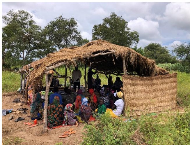
The first classroom made from local materials in Naray, Chad.