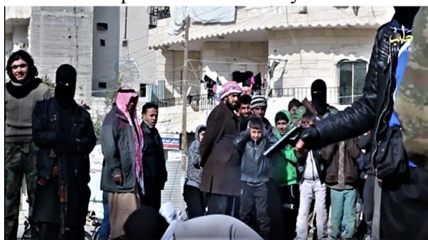
Young boys cover their ears and are seen visibly shaken and frightened as they are coerced to witness a public execution

Desensitizing children to violence is another one of Daesh's tactics for recruitment. Children, as young as four and five years old, are forced to witness public executions and torture. 9 Moreover, they are encouraged to incorporate forms of violence in their everyday play activities, such as beheading stuffed toys or pretending to be militants with toy weapons. Based on the analysis of the data reviewed for this report, 36% of the videos had children carrying and flaunting weapons, while 27% of the videos had children as firsthand witnesses of killings and bloodshed. Having internalized violence as a way of life through such exposure and through the ongoing wars, joining Daesh's rank as a militant becomes a preference for many children.