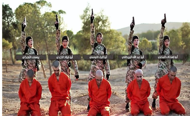
Child militants carrying out execution of Daesh's enemies

Participants in Violence: Conscription of children by armed groups to use in wars is not a new phenomenon in itself. Conventionally, however, the use of children has been limited to fulfill supplementary war assignments or to fill the ranks of adult militants. 24 Daesh, on the other hand, regularly deploys children as main actors alongside their adult counterparts for intensely violent operations. In its propaganda media, Daesh proudly exhibits its children as shooters, executioners, suicide bombers, and soldiers on the battlefield. 25 Children are also trained as young officers responsible for punishing and torturing the “caliphate’s” prisoners and dissidents.